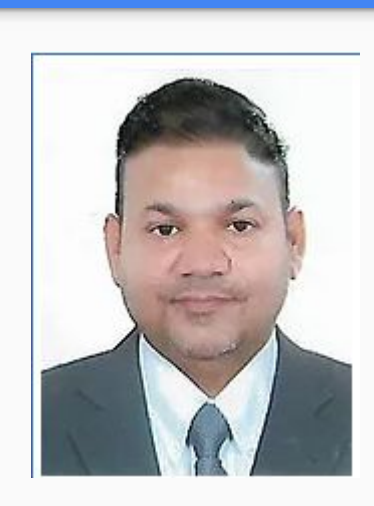
ITA Ambassador in Bahrain