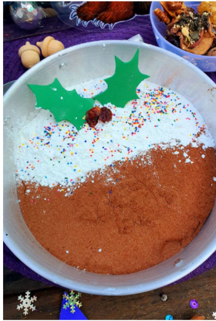
"Mix, Mix, Mix" Maverick - 3 years

or the Gruffalo Crumble Mud Kitchen we used a variety of pots, pans and containers. We found real life kitchen items such as a rolling pin, spoons and a teapot for the children to explore. We added tiny loose parts and trinkets for counting, sorting and arranging. Items such as foam snowflakes, holly leaves, bells, spangle pipe cleaners, fresh oranges and sprinkles. We also added the story book, so the children could revisit the story and explore language which can spark some new ideas in their creativity. Where possible, try and print the characters from the book and add them to your provocation, this way children can use them as they play and practice new language.