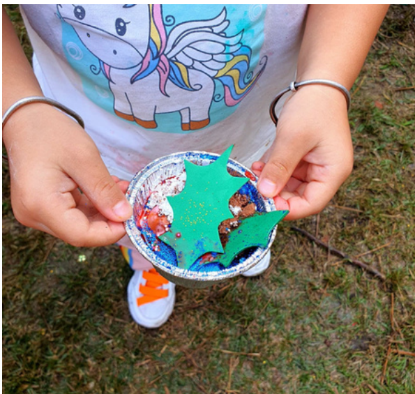
"Holly Cake" Jassie - 3 years