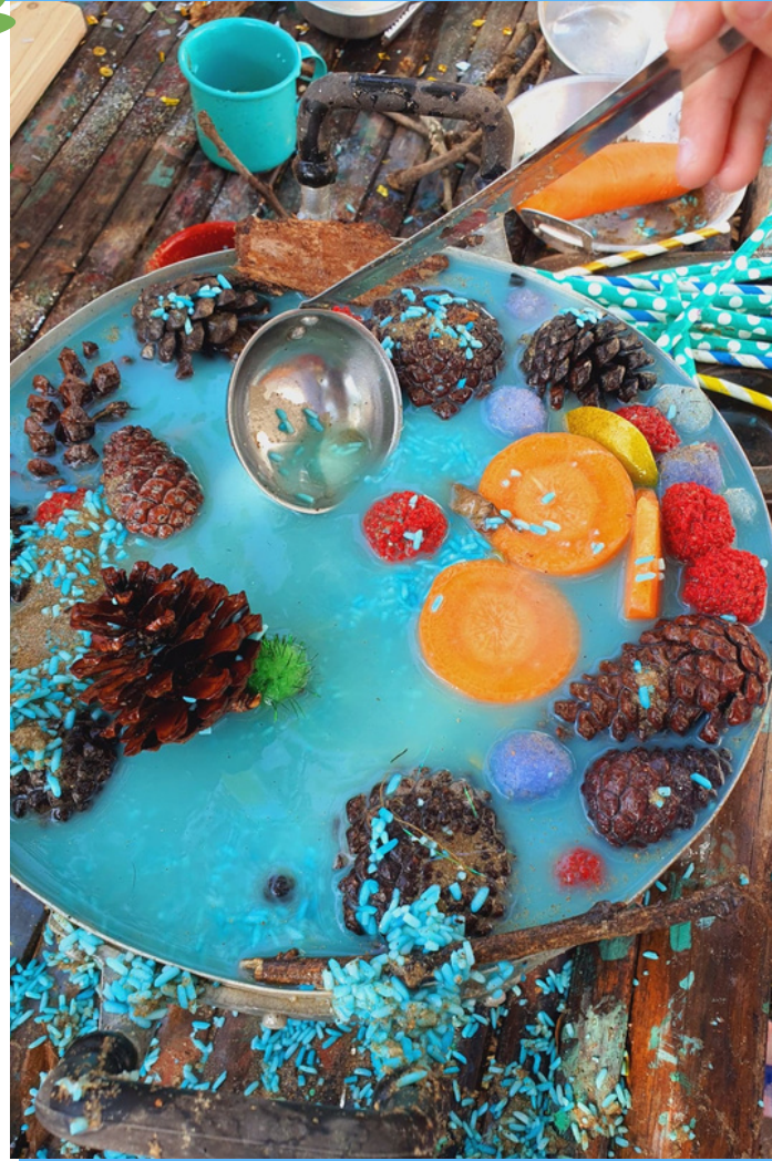
"A rock, an orange, a pinecone, some syrup" Tyree & Maverick - 3 years

. Mud kitchens are wonderful for sparking curiosity and encouraging children to explore together, get messy and have fun. The children found different ways to collaborate and develop ideas together. They filled a pumpkin with water and then began adding natural items and halloween sprinkles. They particularly enjoyed using the different sized shakers and they were fascinated by the different herbs we had popped on to the table. The children used the wooden spoons and magic wands to stir the magic pumpkin potion creation. They took turns exploring the different items, noticing how their creation developed. This activity is a wonderful way to enrich sensory play in the provision with high levels of engagement and the children have open ended access to exploring real life items which are familiar to them in the world around them. Remember to scoop and count the seeds and pulp together with the children, this is all part of the fun and adds to the full experience.