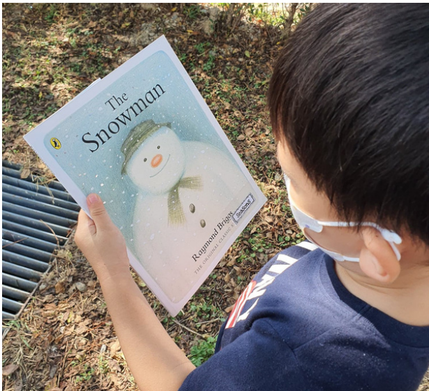
"The snowman has a carrot" Christmas - 3 years